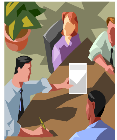
Watch what you are saying...some body may be listening!

"If we don't succeed, we run the risk of failure." Bill Clinton